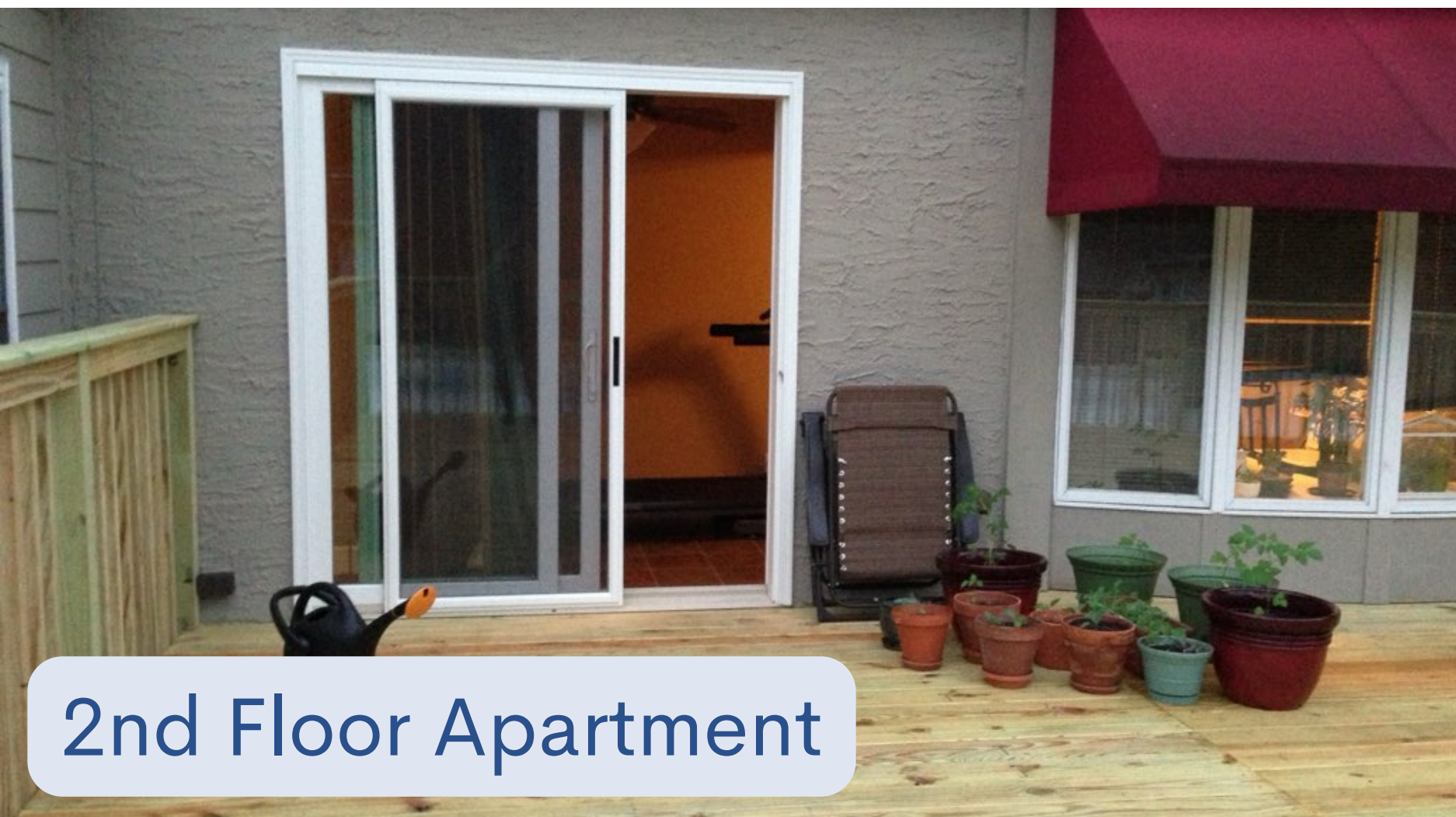
2nd Floor Apartment